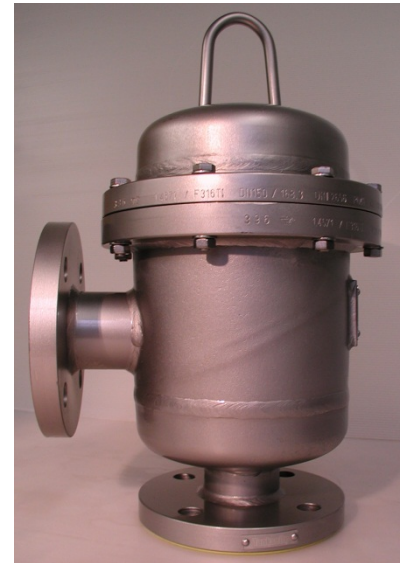
Example to order : KITO® FD6-Det4-IIB3-50-1.2 (Design DN 50 PN 16)

Type examination certificate to DIN EN ISO 16852 and C € -designation in accordance to ATEX-Guideline 94/9/EC in preparation!